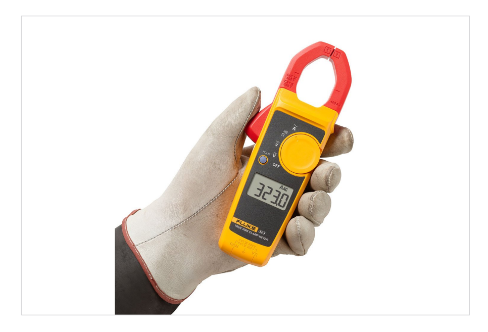
Fluke 323 Fluke 323 True RMS Clamp Meter