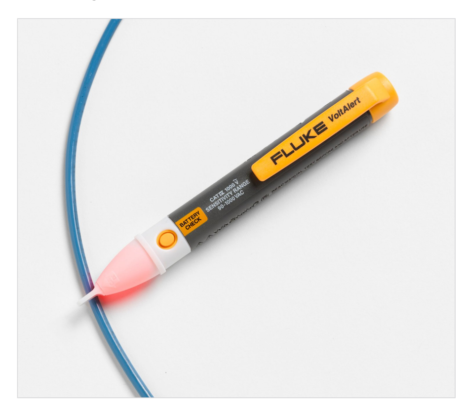
FLK2AC/90-1000V Fluke 2AC VoltAlert<sup>™</sup>Electrical Tester 90-1000V, straight tip for North American style outlets